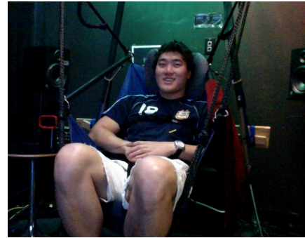
Figure 1. A user suspended in Sonic Cradle during the interview. The lights are turned on for documentation purposes; normally the participant would be in complete darkness.

soundscape using only their breathing". The system's physical characteristics are designed to limit distractions and input from the outside world in order to deemphasize irrelevant aspects of physicality and encourage users to actively co-create their experience. Sonic Cradle is unique in that its aim is to draw attention inward on the sensation of breathing and its influence on sound, as opposed to a visible external stimulus.