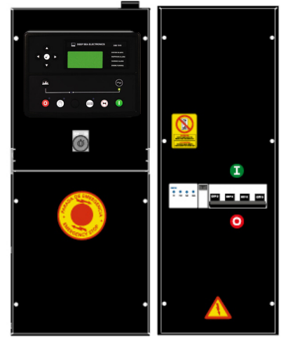
Pictures of Control Panel RH and Distribution Panel LH may include optional equipment and/or accessories

Alternator alarms included: Overload, unbalanced voltage, over voltage, under voltage, over frequency, under frequency, short circuit, reverse power, and incorrect phase sequence.