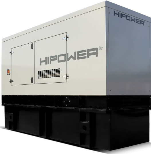
Generator depicted with sound attenuated option, some accessories for display only.