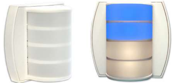
room controller with dome light, 2 LED colors (shown off and on)