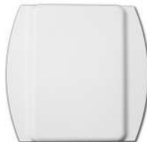
auxiliary input module provides 2 inputs capable of monitoring devices such as door contacts, security panel outputs, and more