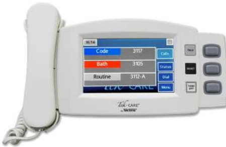
master station with optional handset and cradle