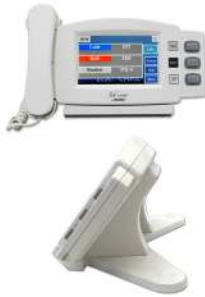
master station with desk mount housing