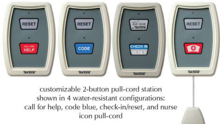
customizable 2-button pull-cord station shown in 4 water-resistant configurations: call for help, code blue, check-in/reset, and nurse icon pull-cord