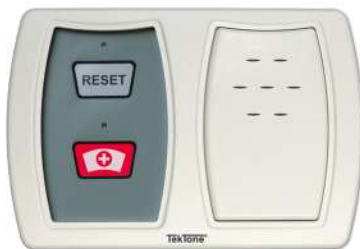
2-button station with speaker