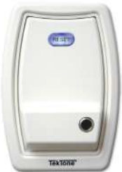
patient station, single 1/4" jack