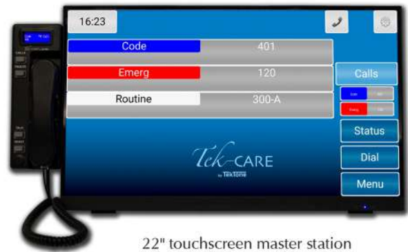
22" touchscreen master station