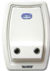
patient station, dual 1/4" jacks