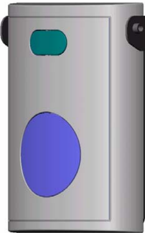
Step 2 Attach the station to the base