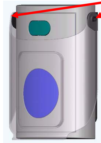
Step 3 Attach the cover (shown in the resting position)