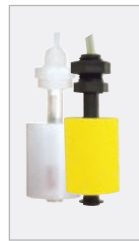
LV35/36 High Temp Float