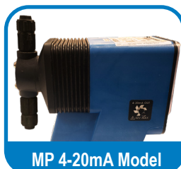
MP 4-20mA Model