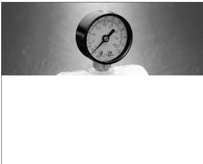
GGMU above, shown with Schedule 80 male spigot ends for fusion (Code C3 below) and optional 2" gauge.

The overall "G" dimension will vary according to which end connectors are selected. Three standard end connectors are available; one for metric piping, one for Schedule 80 piping, and one for sanitary piping to meet requirements of the major piping systems in the marketplace. End connectors can also be made to custom lengths if required. Each GGMU must be