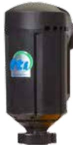
Ex-Proof (M7XV, M8XV)