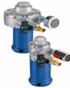
Air (M6, M6X)