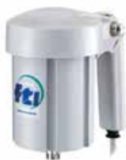
ODP (S1, S2, S3, S6*)