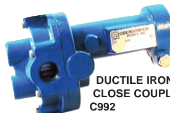
DUCTILE IRON CLOSE COUPLED C992