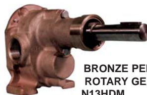
BRONZE PEDESTAL ROTARY GEAR N13HDM