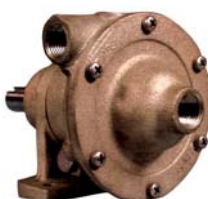
BRONZE CENTRIFUGAL 50P