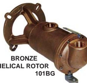
BRONZE HELICAL ROTOR 101BG