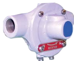
RUBBER ROLLER 310F