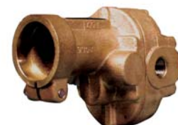
BRONZE CLOSE COUPLED N991