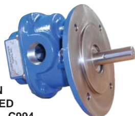
DUCTILE IRON CLOSE COUPLED C994