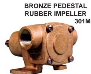
BRONZE PEDESTAL RUBBER IMPELLER 301M