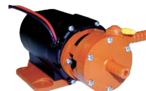
PLASTIC CENTRIFUGAL 144