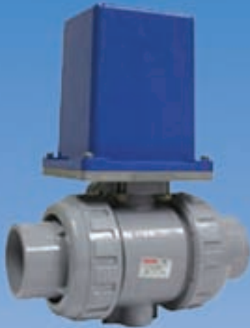
Series 83/Type-21 Ball Valve