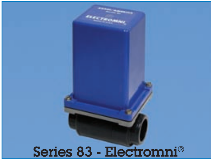
Series 83 - Electromni®