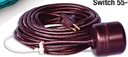
Optional Piggyback Float Switch 55-931

Slim-design, light weight CSA listed submersibles feature top discharge as well as cast-iron impellers, 304 stainless steel casing, motor housing, shaft and hardware. Pump motor is thermal overload protected. An optional piggyback mercury-free float switch is available. Float Switches: The mercury free liquid level control has a piggyback plug molded to the cord allowing the pump motor to plug into the cord and then plug the entire assembly into a standard grounded outlet.