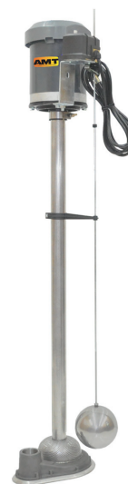
Stainless Steel TEFC Model Sump Pump

The AMT line of Industrial/Commercial Sump pumps is designed for heavy duty commercial applications, as well as residential use where a combination of durability and high performance is required. AMT Sump pumps are available in stainless steel, bronze and cast iron constructions with TEFC motors in 1/3 through 3/4 HP for proper pump selection in most applications. All models include stainless steel shaft, screen and float. All motors are fitted with automatic switch and an 8 foot 16/3 115 VAC line cord. Pumps require minimum sump pit of 14" diameter and 24" depth. Pumps are designed to handle liquids with solids contents or dissolved solids and debris.