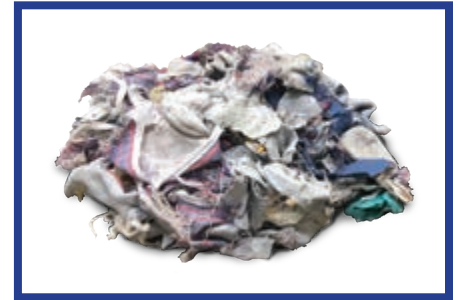
Solids size reduction to 1" to 3" prevent clogging of down-stream component