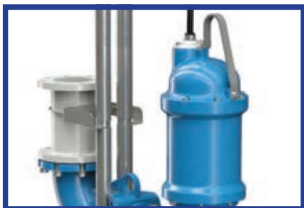
Numerous options, kits & accessories