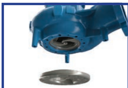
Field replaceable blades