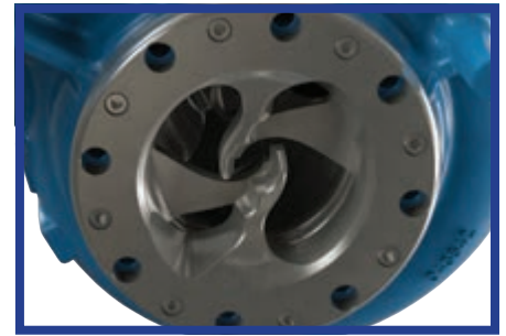
Unique, patented open center cutter mechanism