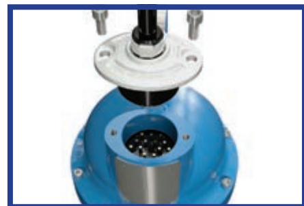
Plug-n-play quick connect cord