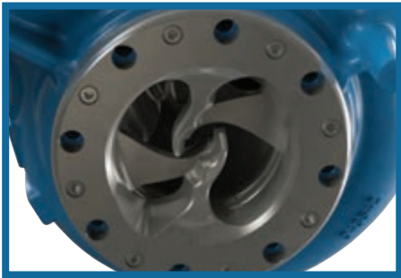
Unique, patented open center cutter mechanism