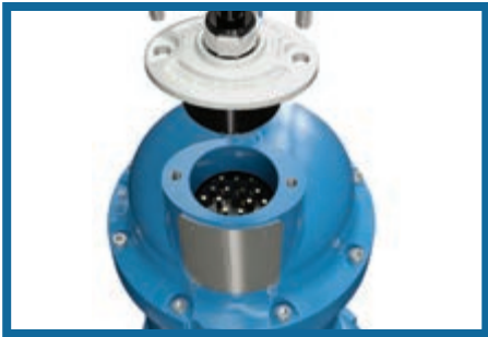
Plug-n-play quick connect cord