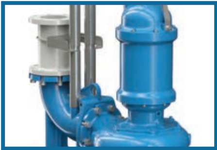
Numerous options, kits & accessories

Numerous options are available for maximum flexibility. These include three cord sizes, seal materials and mounting options. Recommended accessories like Break Away Fittings (BAF), leg kit and relay are common with Barnes SH non clog pumps. BAF facilitate easy installation or removal of pumps via a slide rail system. Leg kits support the pump in floor mounted installations. Control panels are available for simplex and multiple pump installations, and customized to meet specifications. Other accessories include pit covers with access doors, lifting chains, pump hoists, level controls and check valves.