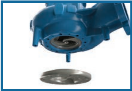
Field replaceable blades