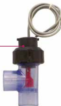
STANDARD PANEL AND FLOW ASSEMBLY