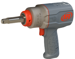
2236QTIMAX-2 2" Extended Friction Ring Anvil

Titanium Hammer Case Lightweight with unyielding durability