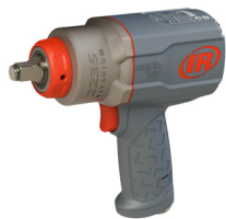
2236QTIMAX Standard Friction Ring Anvil