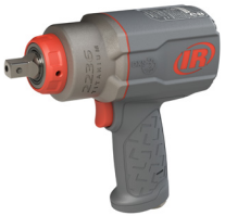
2236QPTIMAX Standard Pin Anvil