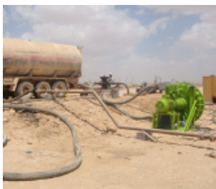
ALH125 crude oil pumping