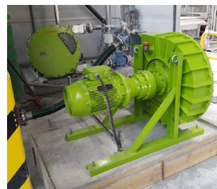
ALHX80 for filter press feeding