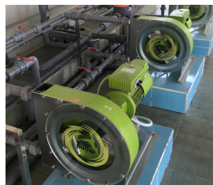
ALP30N lime dosing