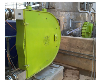
ALX150 and ALH125 for chemical dosing, mining process