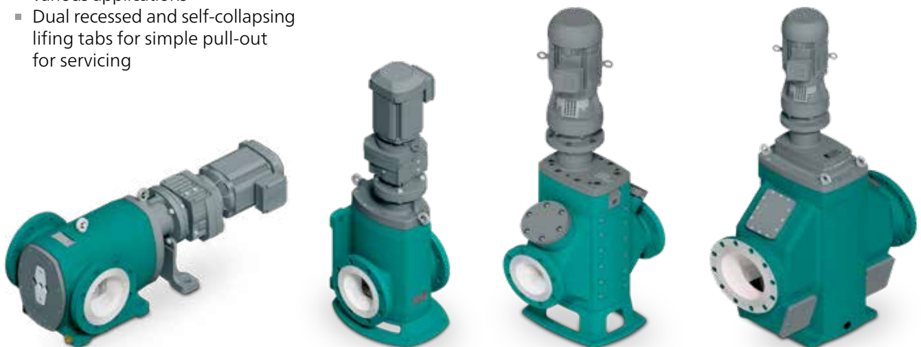
N.Mac ® 50l Horizontal design