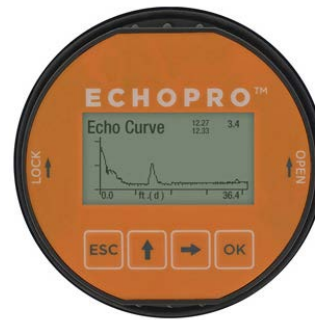
Echo Signal Return Curve