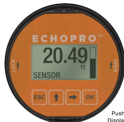
Push Button Display Module