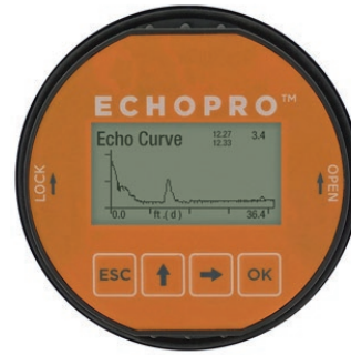
Echo Signal Return Curve