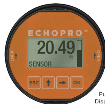
Push Button Display Module