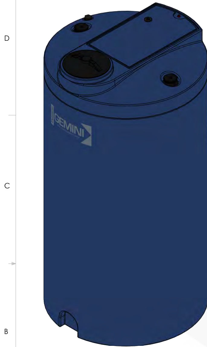
ISOMETRIC VIEW (ASSEMBLED)