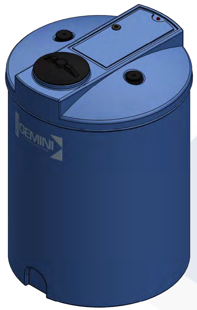
ISOMETRIC VIEW (ASSEMBLED)