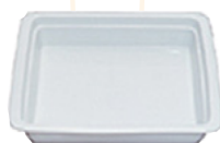
HA5-209 Square Porcelain insert