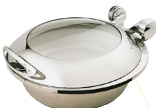
HA6-507 Round Chafer