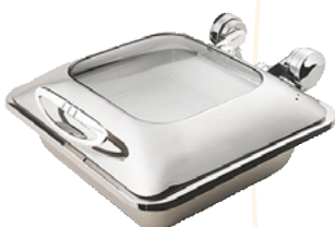
HA5-601 Square Chafer

Elegant and classy chafer units are available in two sizes and styles to suit any situation. These chafers offer 'controlled action' hinges and generous handles for optimum ease of use, with a clear window on the top giving easy viewing of the contents. Highest quality polished stainless steel finish combined with the 'stay open' feature will impress your customers. A full range of inserts, both stainless and porcelain, with or without dividers, and spoon holders completes this impressive range to make your buffet a success.