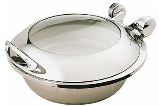
HA6-507 Stainless steel glass top 6.5 L Chafer

*Note: Multi zone units require separate power supply for each generator