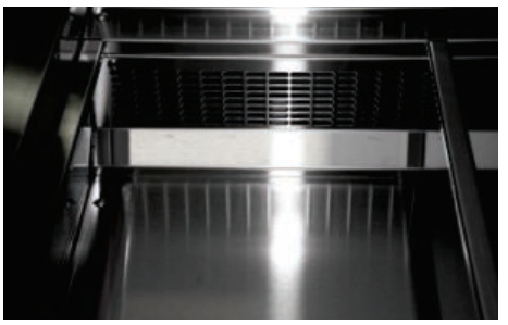
Cool air is blown below the product