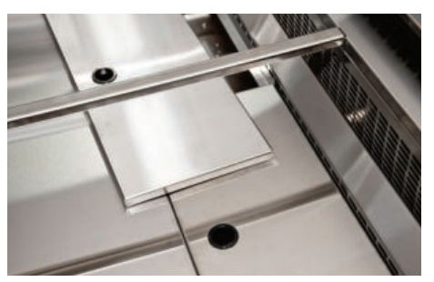
Removable floor panels for easy cleaning