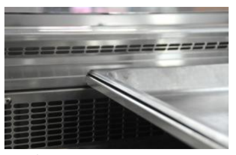
Cool air is blown above the produce

The Woodson buffet style cold well self serve unit uses unique refrigeration principles to ensure food is always kept at the required temperature.