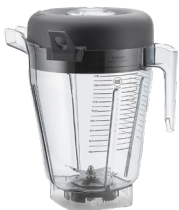
5.6 L XL Container with Lid and Blade Assembly