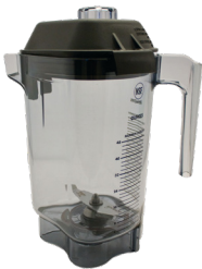
1.4 L Advance Container with Lid and Blade Assembly