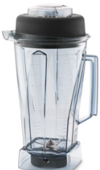
2.0 L Standard Container with Lid and Blade Assembly