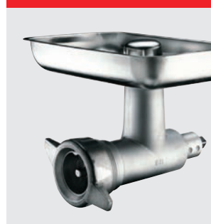
Meat mincer, 82 mm