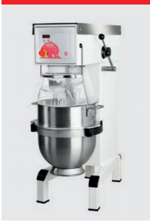
White, powder coated