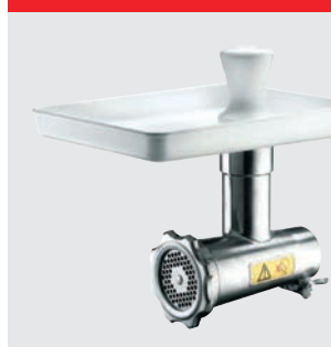
Meat mincer, 70 mm