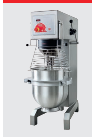
Marine version, stainless steel