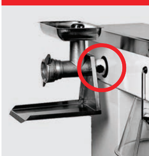
Attachment drive for mean mincer and vegetable cutter