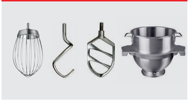
Whip, hook, beater (aluminium food grade) and bowl 80/40 liter in stainless steel.