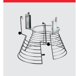
Removable safety guard in stainless steel. Not CE-certified