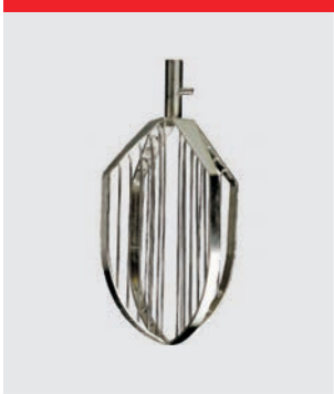
Wing whip, stainless steel