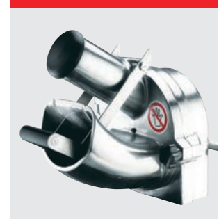
Vegetable cutter GR20