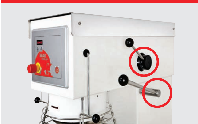
VL-1 – Manual speed regulation and manual bowl lowering