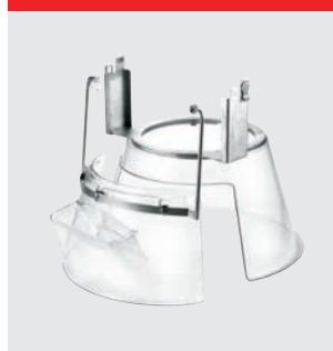
Removable safety guard in plastic. CE-certified