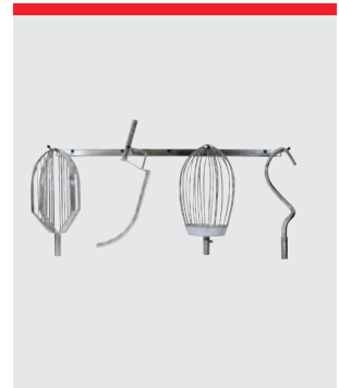
Tool rack, 127 cm