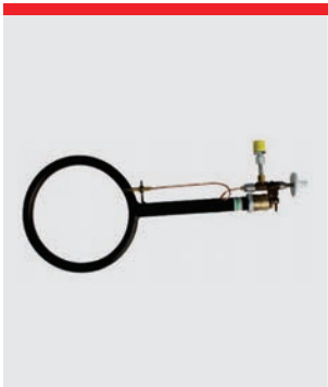
Ring gas burner. Natural or liquid gas.