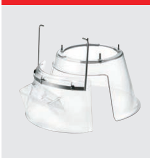
Fixed safety guard in plastic. CE-certified