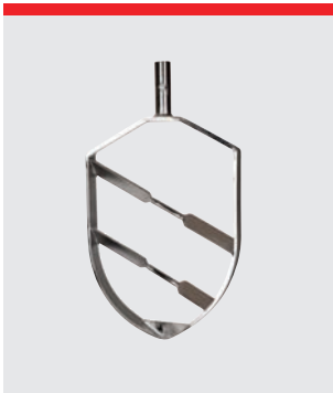
Beater, stainless steel