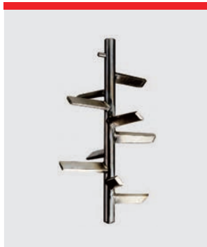
Powder mixer, stainless steel