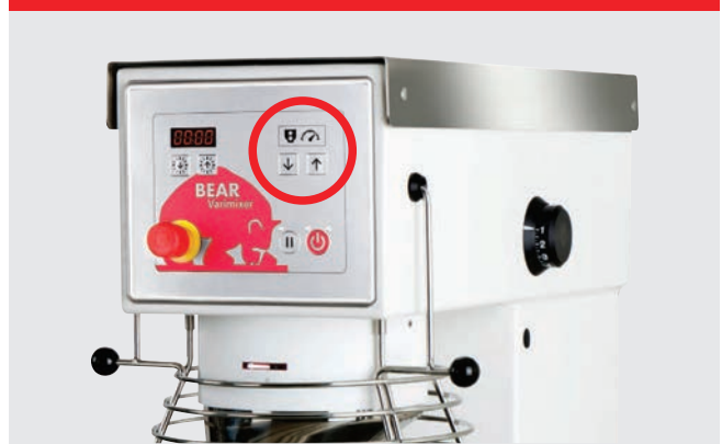
VL-1S – Automatic speed regulation and automatic bowl lowering