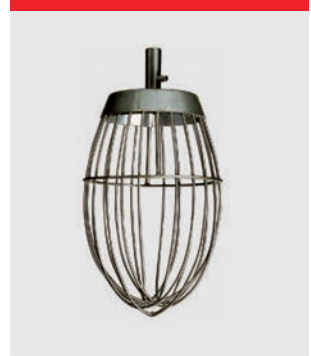
Whip with reinforcement