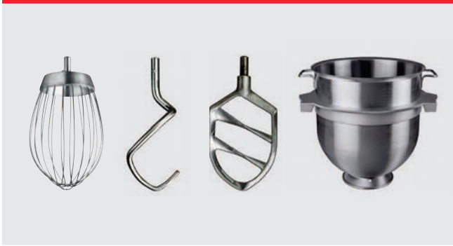
Whip, hook, beater (aluminium food grade) and bowl 80 liter in stainless steel.