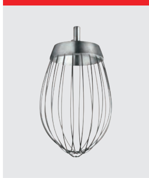
Whip with thinner wires, stainless steel