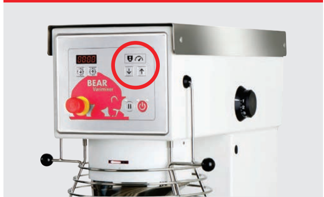
VL-1S – Automatic speed regulation and automatic bowl lowering