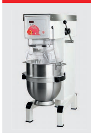
Pizza version, white, powder coated