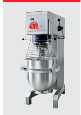
Marine version, stainless steel