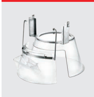
Removable safety guard in plastic. CE-certified