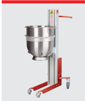
Easylift 60 II