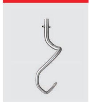
Double pinned hook for pizza