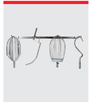
Tool rack, 127 cm