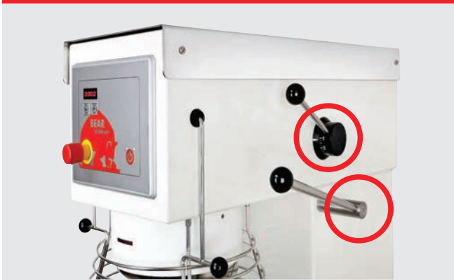
VL-1 – Manual speed regulation and manual bowl lowering