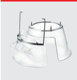
Fixed safety guard in plastic. CE-certified