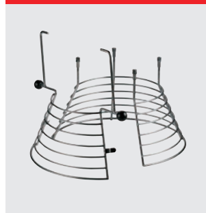
Fixed safety guard in stainless steel. Not CE-certified