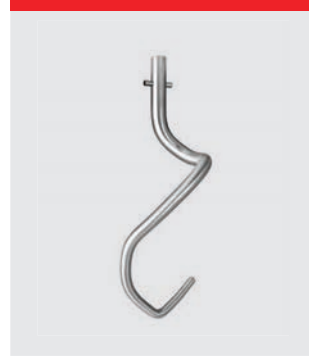
Double pinned hook for pizza