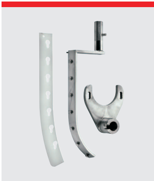
Automatic scraper, stainless steel. Nylon or teflon blade. 40L and 40/20L.