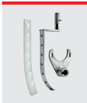
Automatic scraper, stainless steel. Nylon or teflon blade. 100L, 100/60l, and 100/40L.