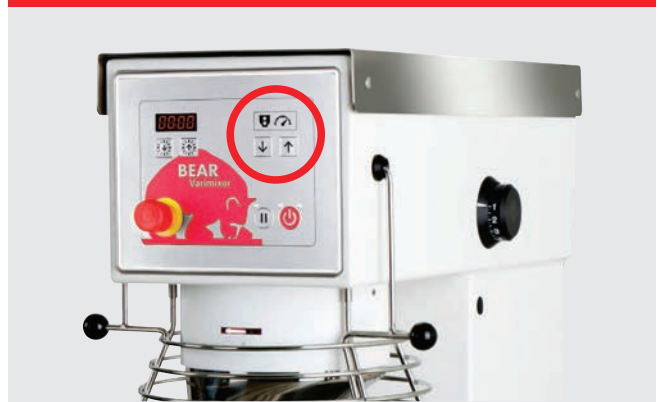
VL-1S – Automatic speed regulation and automatic bowl lowering