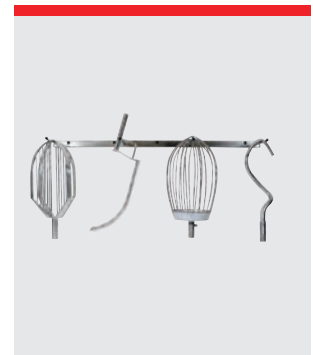
Tool rack, 127 cm