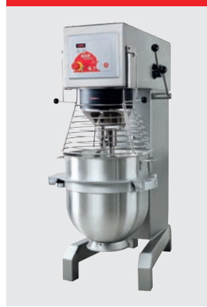
Marine version, stainless steel