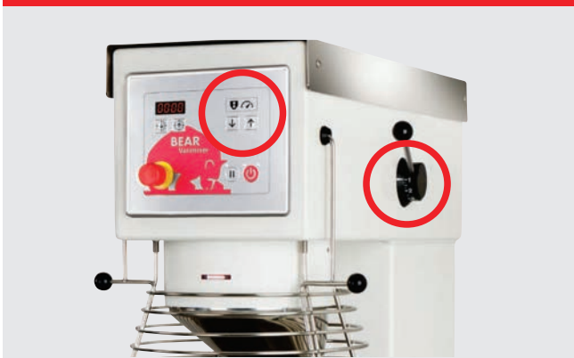
VL-1L – Manual speed regulation and automatic bowl lowering