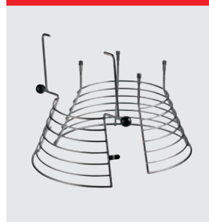
Fixed safety guard in stainless steel. Not CE-certified