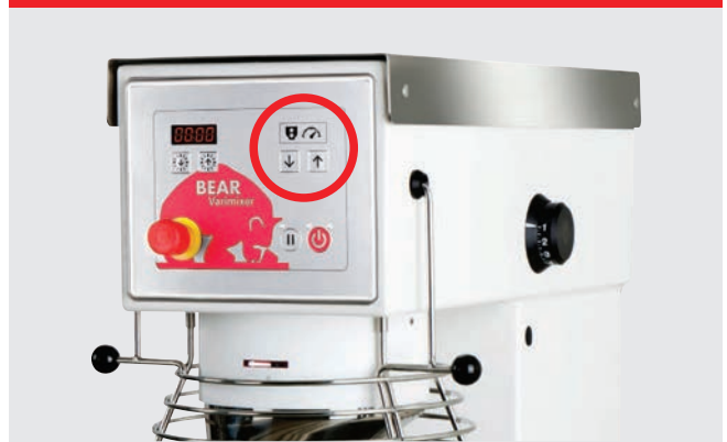
VL-1S – Automatic speed regulation and automatic bowl lowering