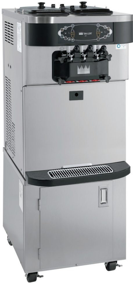
Shown with optional standard height cart