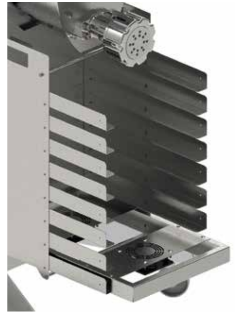
Optionals RACK: tray holder DRYER: pasta dryer