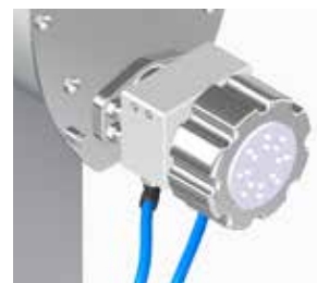
Frio 10 Optional head cooling kit