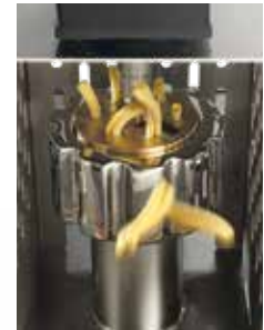
Pasta Cutter Accessory