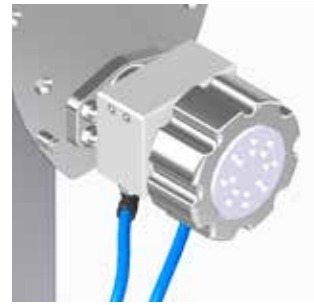
Frio 5: Optional head cooling kit