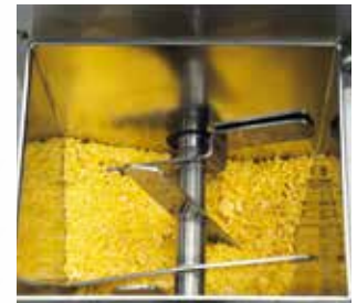
Mixing hopper designed to better knead pasta dough