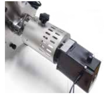
Pasta Cutter optional