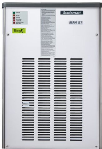
Nugget ice 1g – Ø 11mm x H 13mm