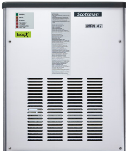
Nugget ice 1g – Ø11mm x H 13mm