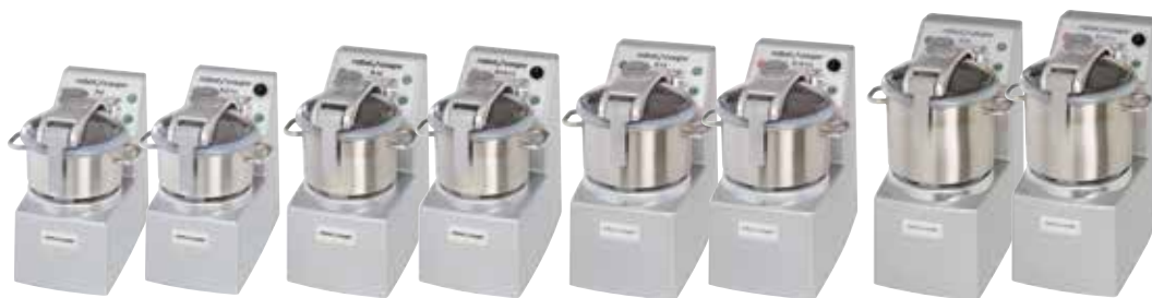
R 8 - R 8 V.V.