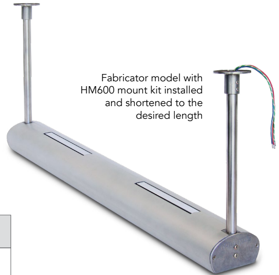
Fabricator model with HM600 mount kit installed and shortened to the desired length