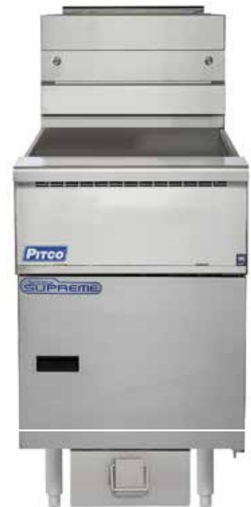
Solid State Control option shown

Note: The controller style must be specified when ordering. Standard fryers come with one type only.