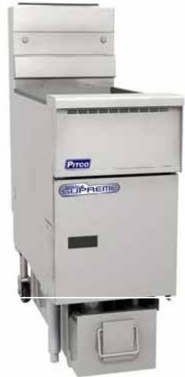
Solid State Control option shown

Note: The controller style must be specified when ordering. Standard fryers come with one type only.