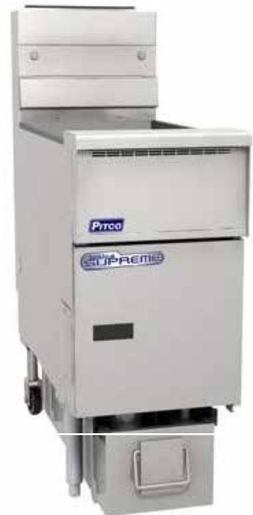
Solid State Control option shown

Note: The controller style must be specified when ordering. Standard fryers come with one type only.