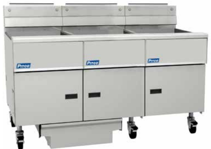
Solid State Control option shown

Please note, due to ongoing product development and improvement, we reserve the right to change product design and specification at any time without notice.