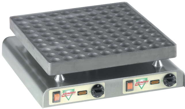
100 trough unit