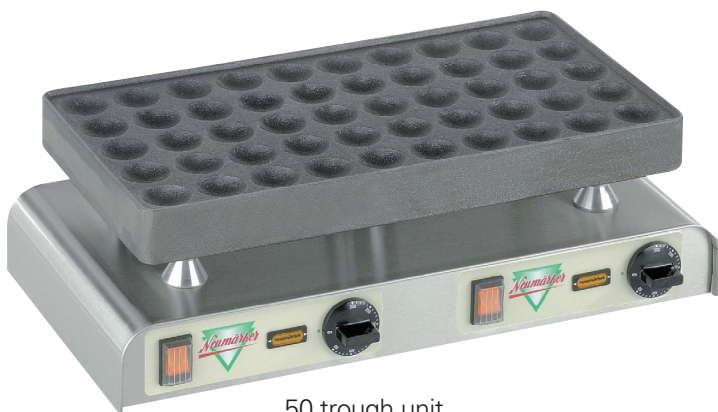
50 trough unit