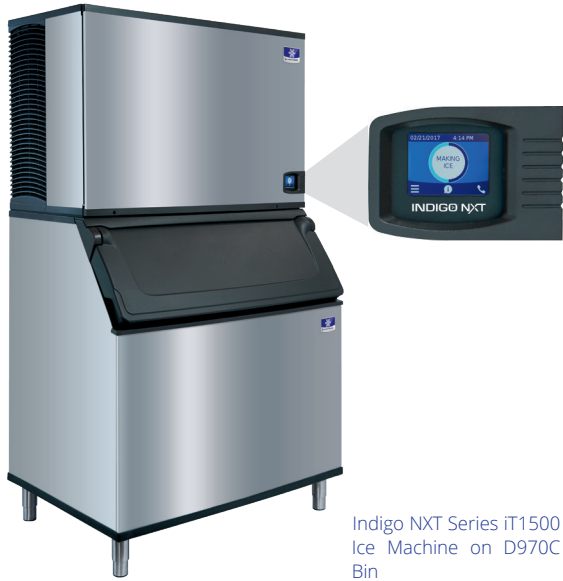
Indigo NXT Series iT1500 Ice Machine on D970C Bin

Designed for operators who know that ice is critical to their business, the Indigo NXT Series ice machine's preventative diagnostics continually monitor itself for reliable ice production. Improvements in cleanliness and programmability make your ice machine easy to own and less expensive to operate.