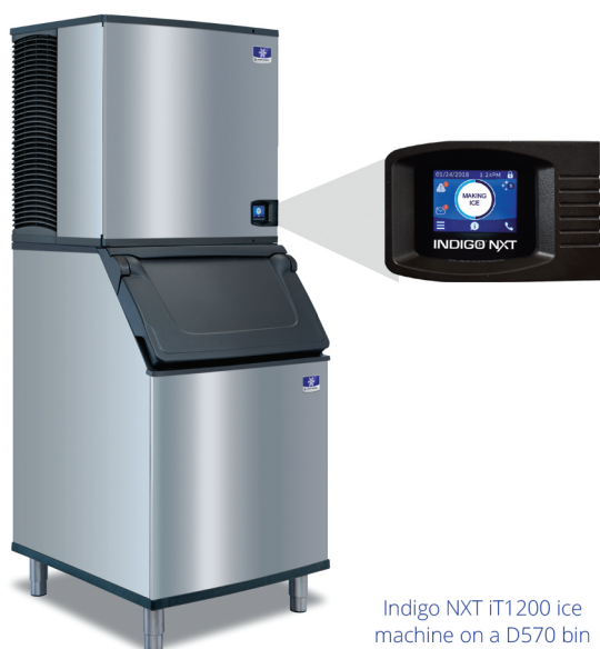
Indigo NXT iT1200 ice machine on a D570 bin

Designed for operators who know that ice is critical to their business, the Indigo NXT Series ice machine's preventative diagnostics continually monitor itself for reliable ice production. Improvements in cleanability and programmability make your ice machine easy to own and less expensive to operate.