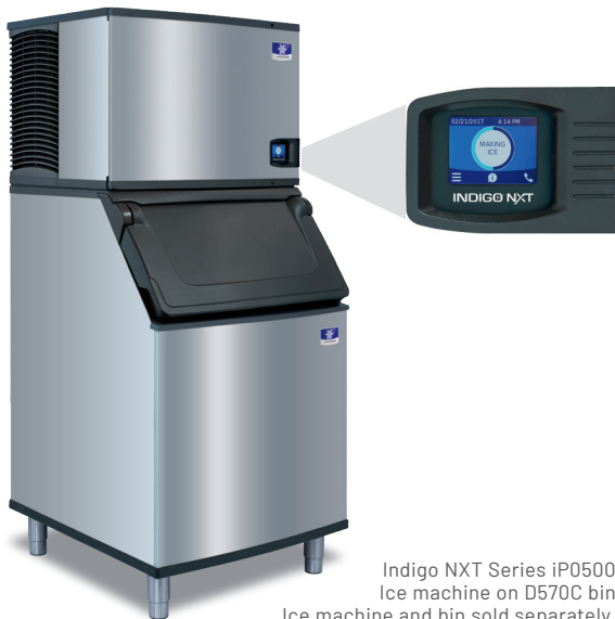
Indigo NXT Series iP0500 Ice machine on D570C bin Ice machine and bin sold separately.

Designed for operators who know that ice is critical to their business, the Manitowoc Indigo NXT Series Ice Machine provides reliable and consistent performance. Built-in preventative diagnostics and programmable operation help minimize downtime and optimize total cost of ownership.